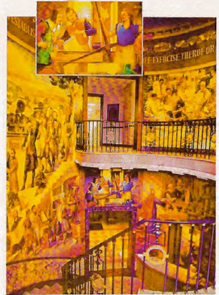
Poughkeepsie Journal Atrium Rotunda mural, 1942