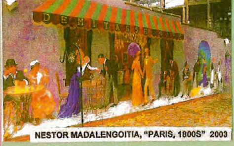
NESTOR MADALENGOITIA, "PARIS, 1800S" 2003