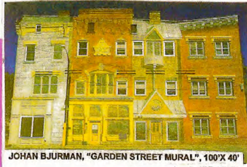
JOHAN BJURMAN, "GARDEN STREET MURAL", 100'X 40'

For more information and reservations contact: Franc - 845-486-1378, cell- 845-505-3123 FPalaia@earthlink.net