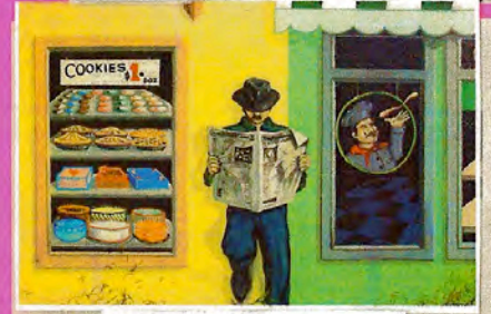
Detail of Olde Main Street mural