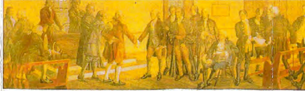
New York delegates meet in 1789 on ratifying the U.S. Constitution, from a mural in the lobby of the Poughkeepsie Post Office.