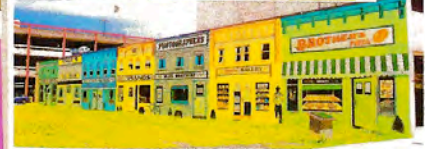
FRANC PALAIA- "Olde Main Street mural, 2002

As seen on TV Ch. 6 and featured in Hudson Valley Mag., Pok. Journal and Mercantile Magazine