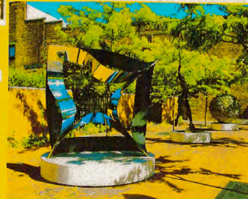
BURT GOLD Sculpture Park, Main St.