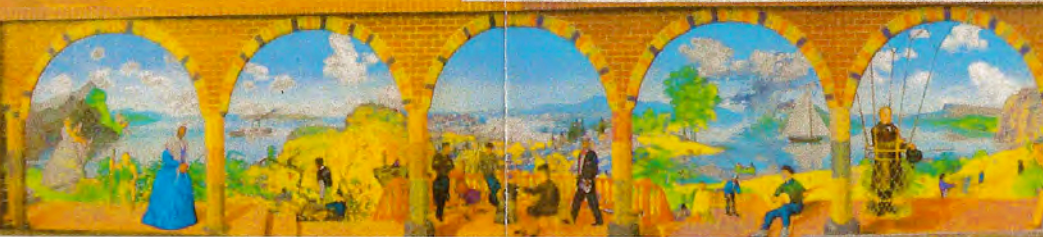
NESTOR MADALENGOITIA, "HUDSON RIVE SCHOOL-THEN & NOW" 2003