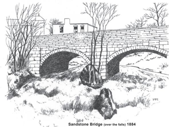
Sandstone Bridge (over the falls) 1884